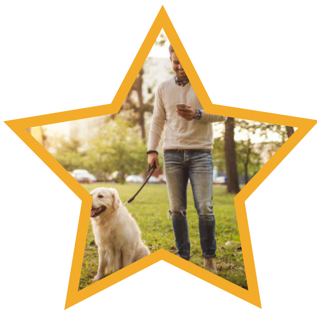
Walking or biking (with or without pets)