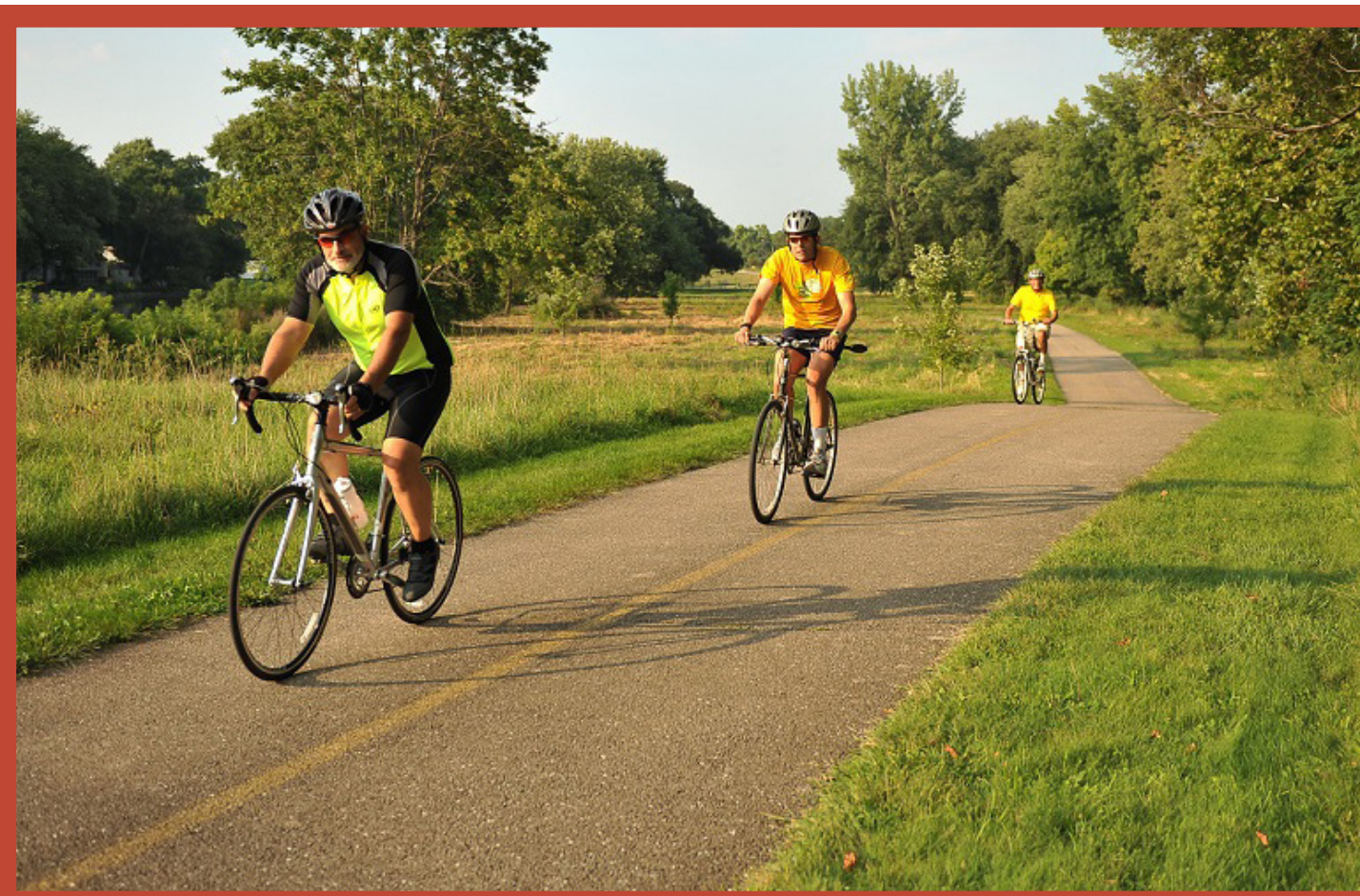
Dedicated cycling routes