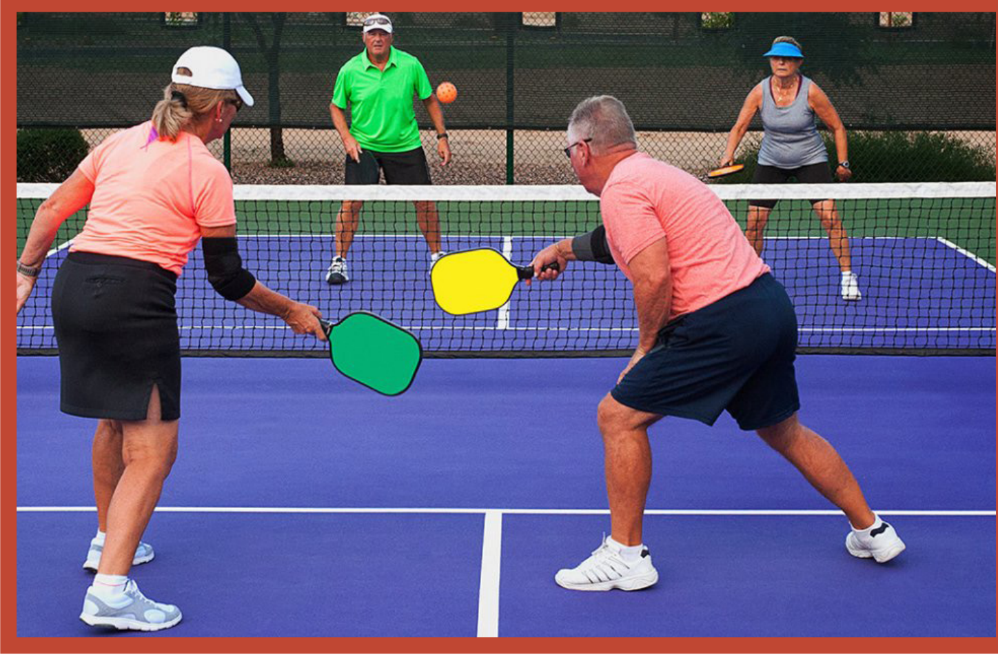
Pickleball or other types of sport courts

What recreation opportunities do you see happening in this park? Place a dot on your favorite ideas!