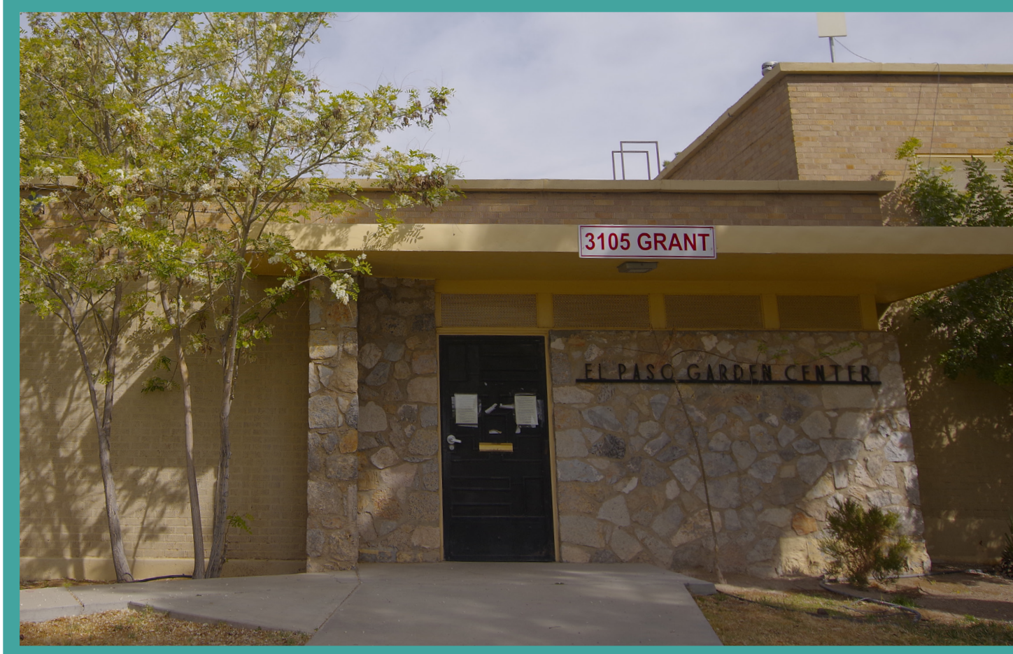
Community space in repurposed garden center

What community or cultural opportunities do you see happening in this park? Place a dot on your favorite ideas!