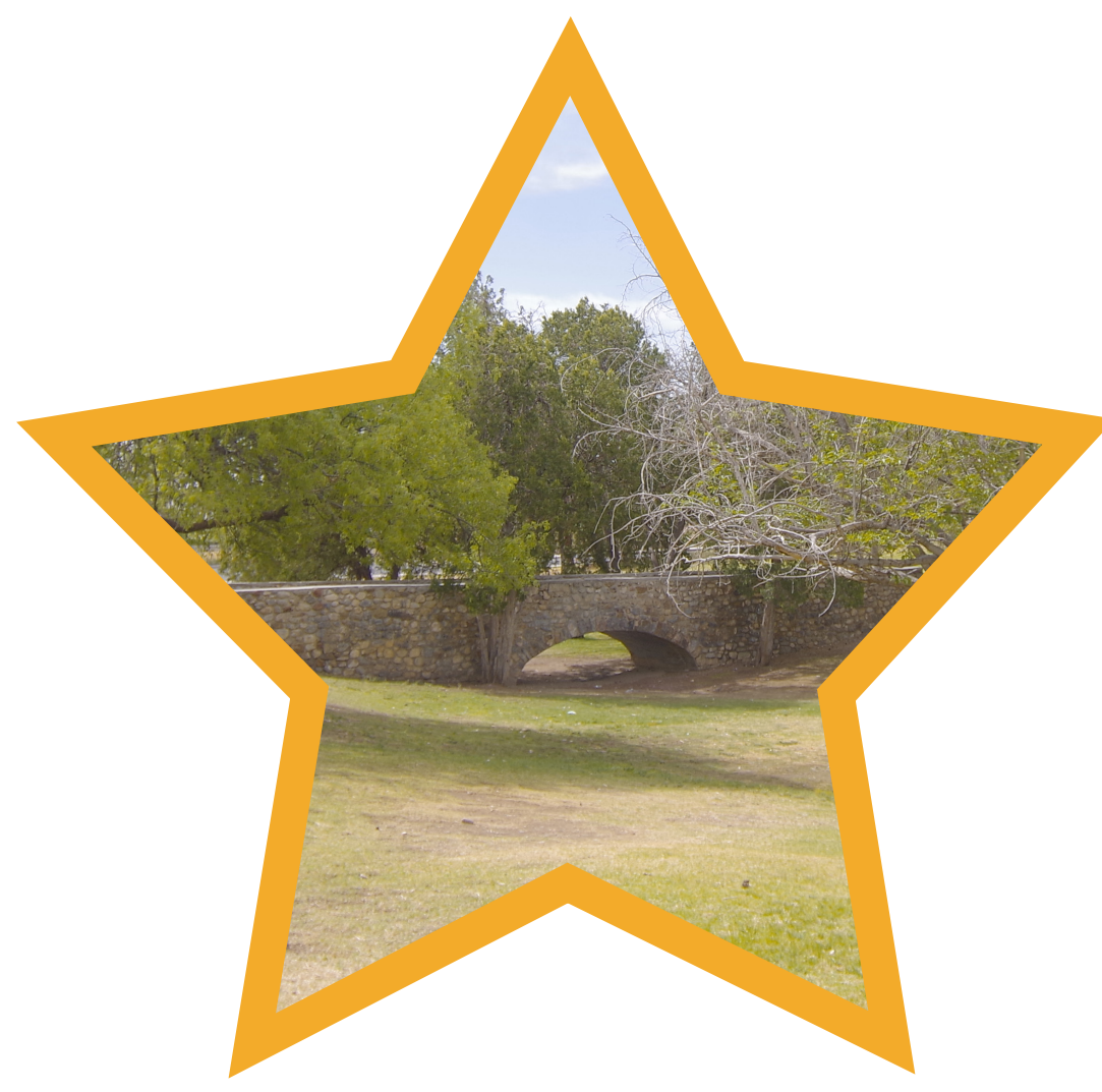
Visiting historical amenities