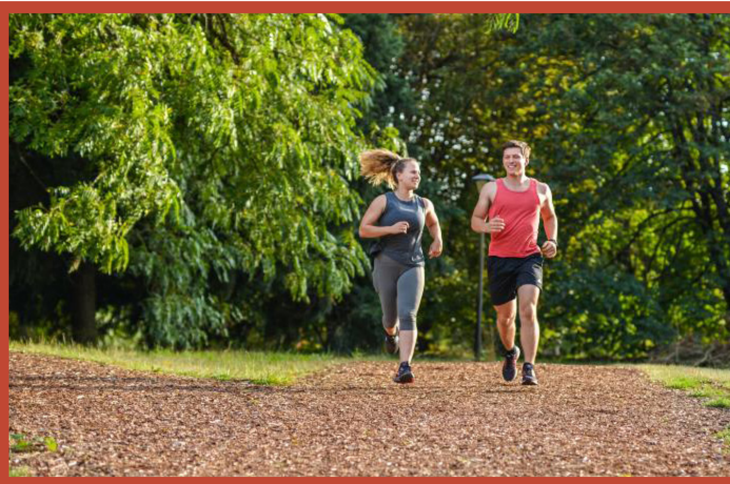
Soft surface trails