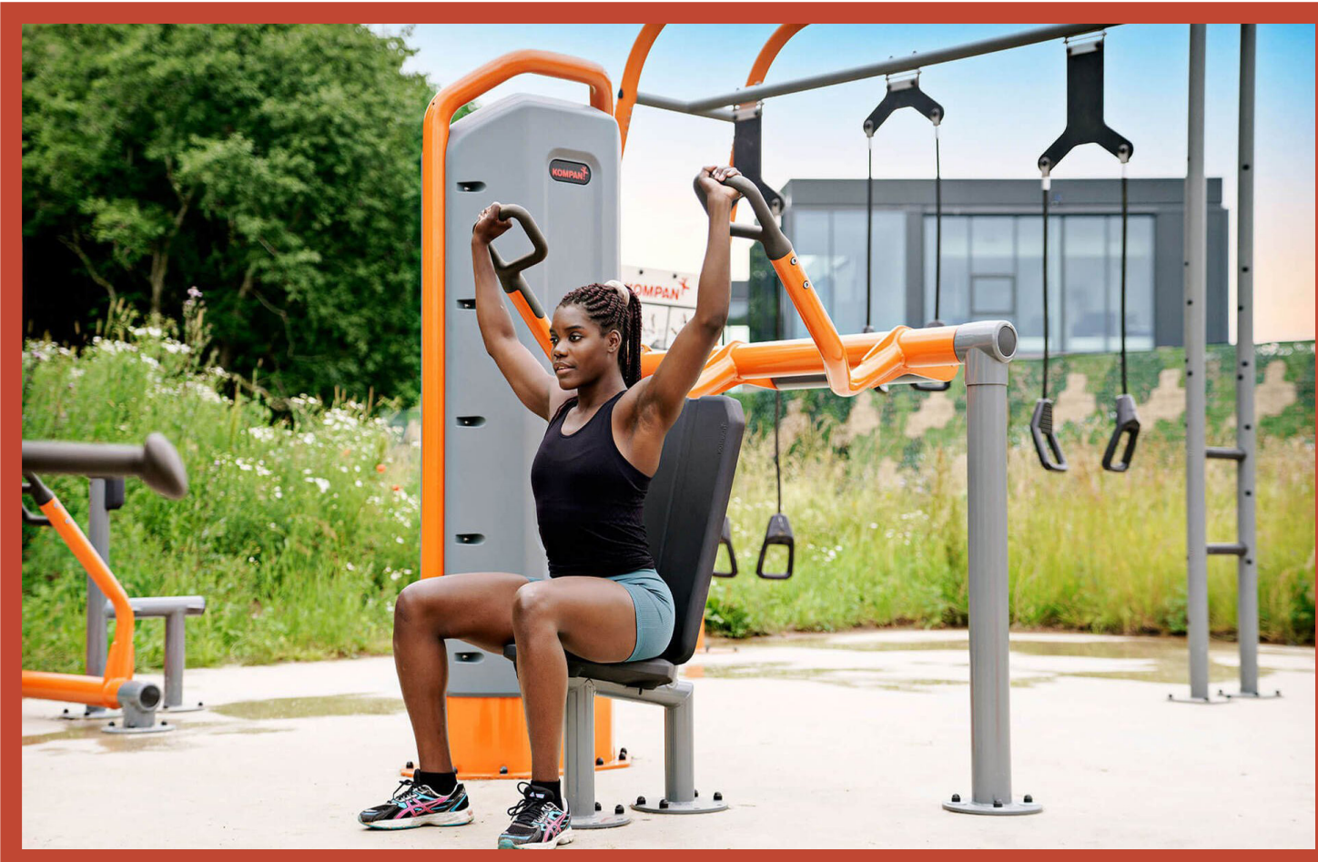
Adult fitness equipment