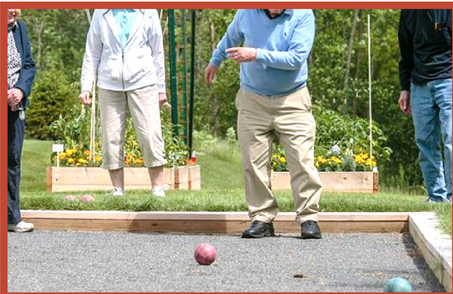
Bocce / Lawn games