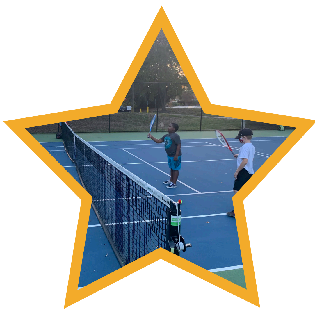
Playing tennis at the courts