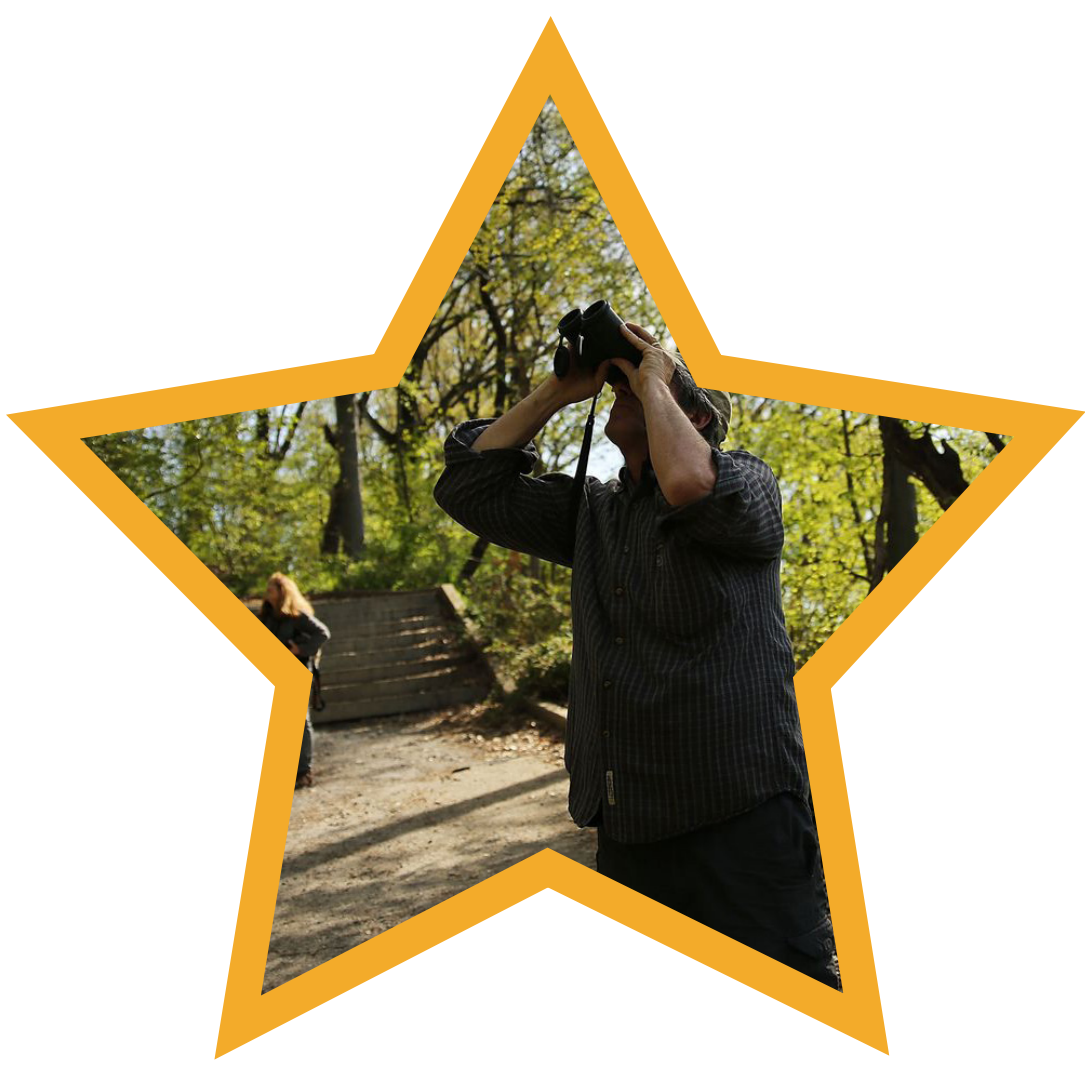
Spending time in nature

How do you use this park? Place a dot on your favorite thing(s) to do!