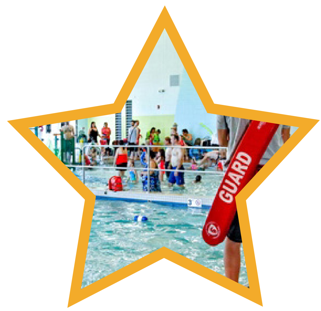
Swimming at the pool facility

What other ways do you use the park? Use a sticky note and tell us!