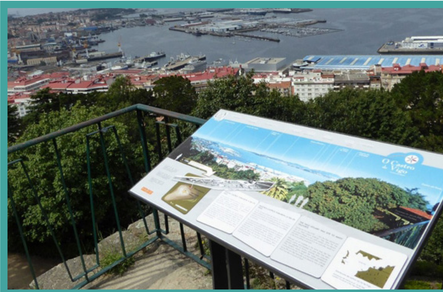
Scenic view interpretation