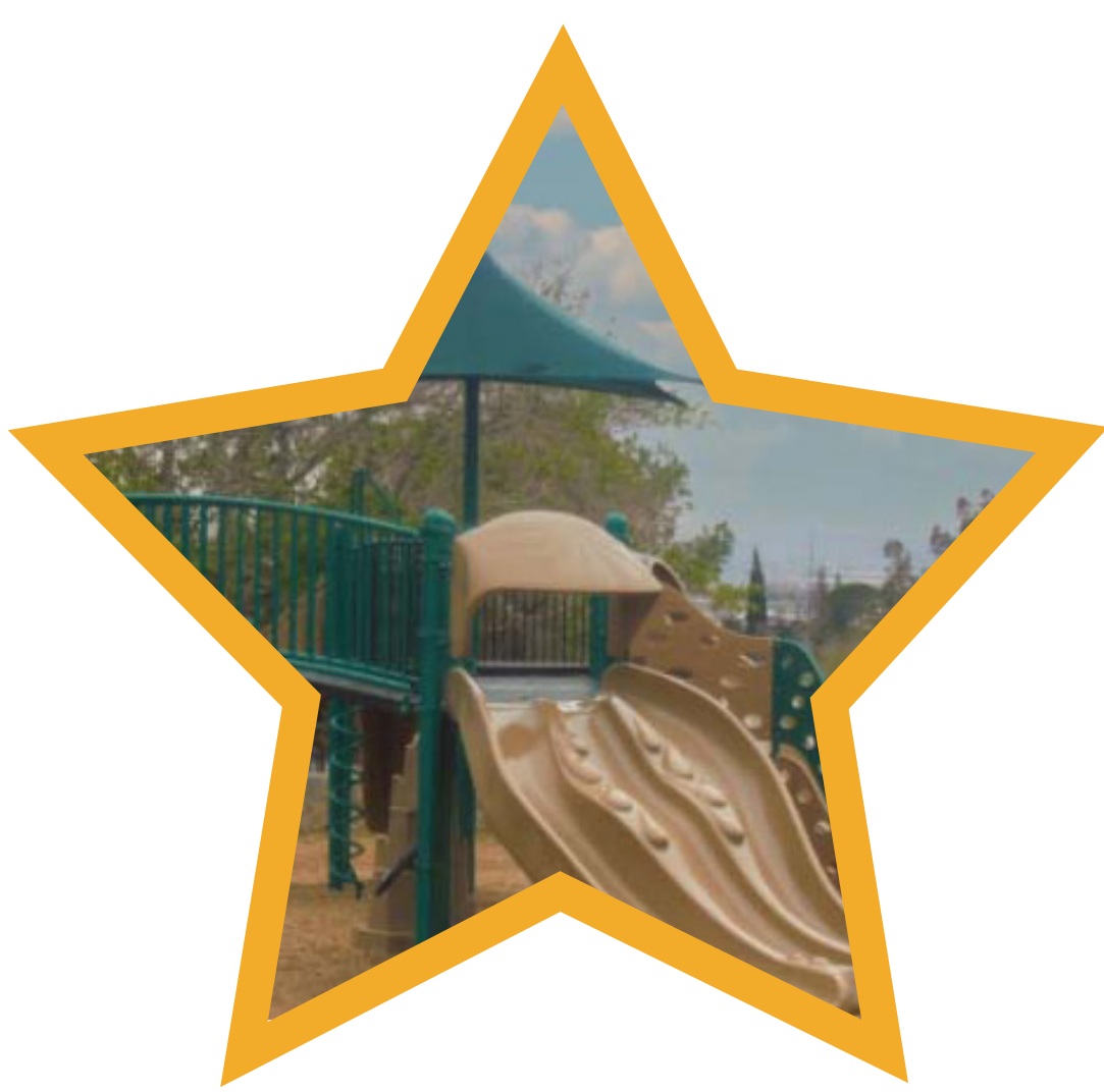
Using the playground