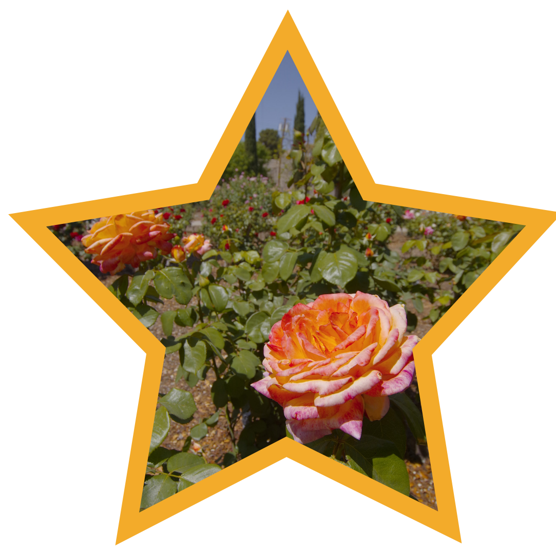
Visiting the rose garden