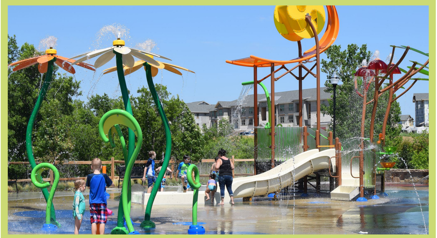
Water / Splash play