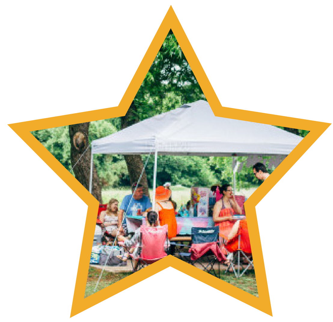
Spending time with family and friends