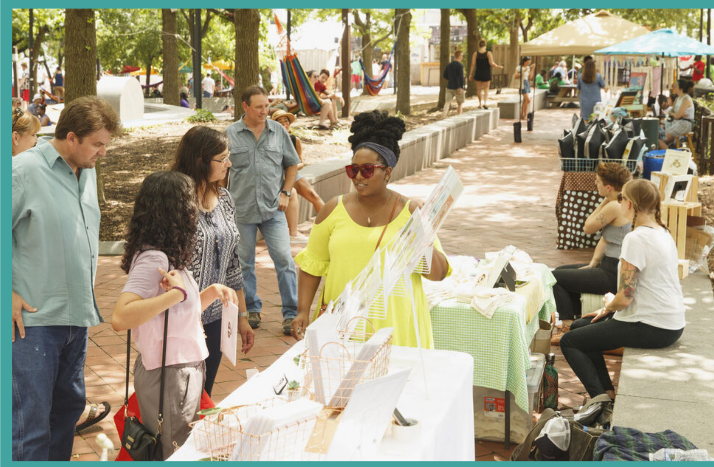
Maker's / Farmer's market