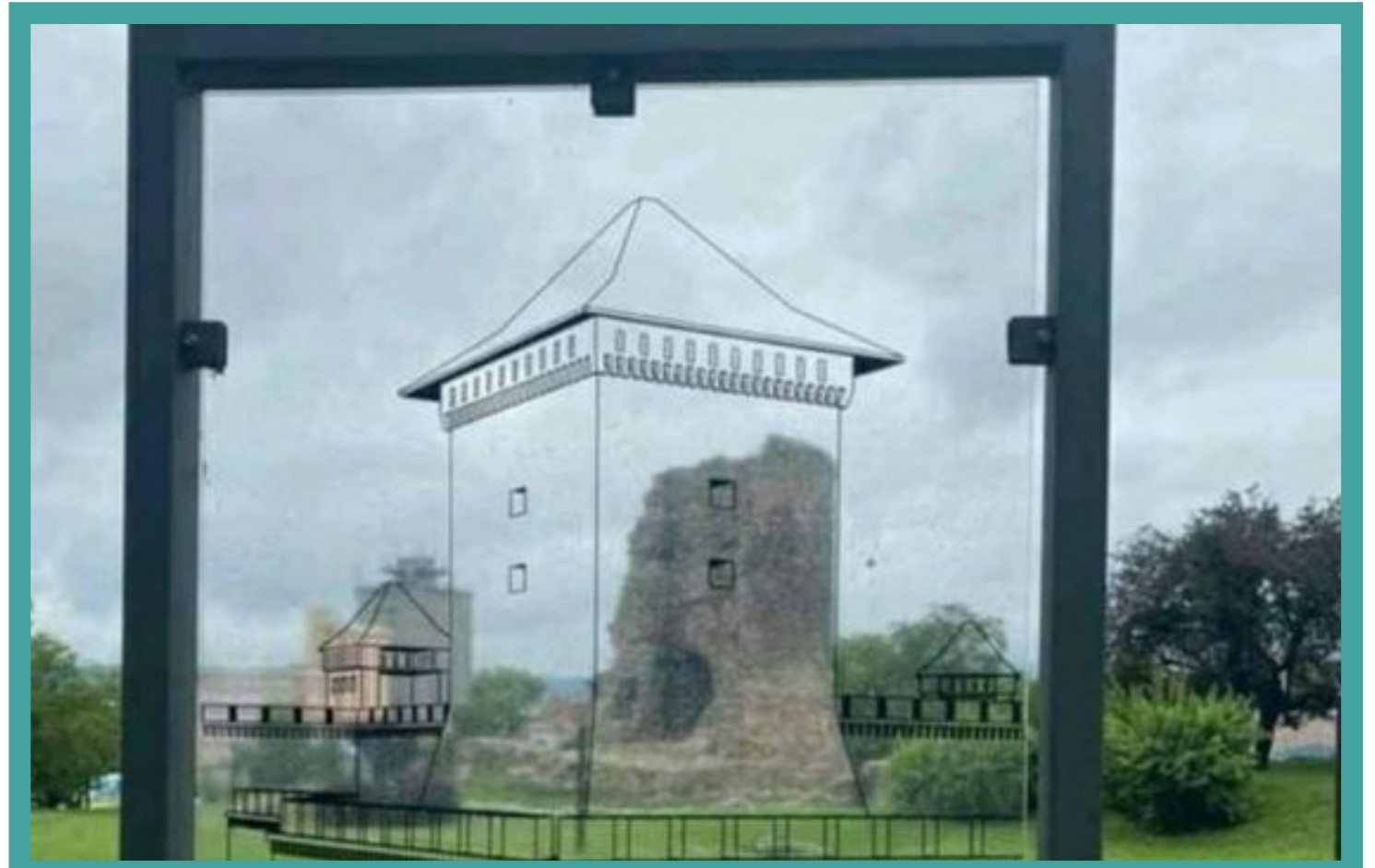
Honor historical park plan and park features