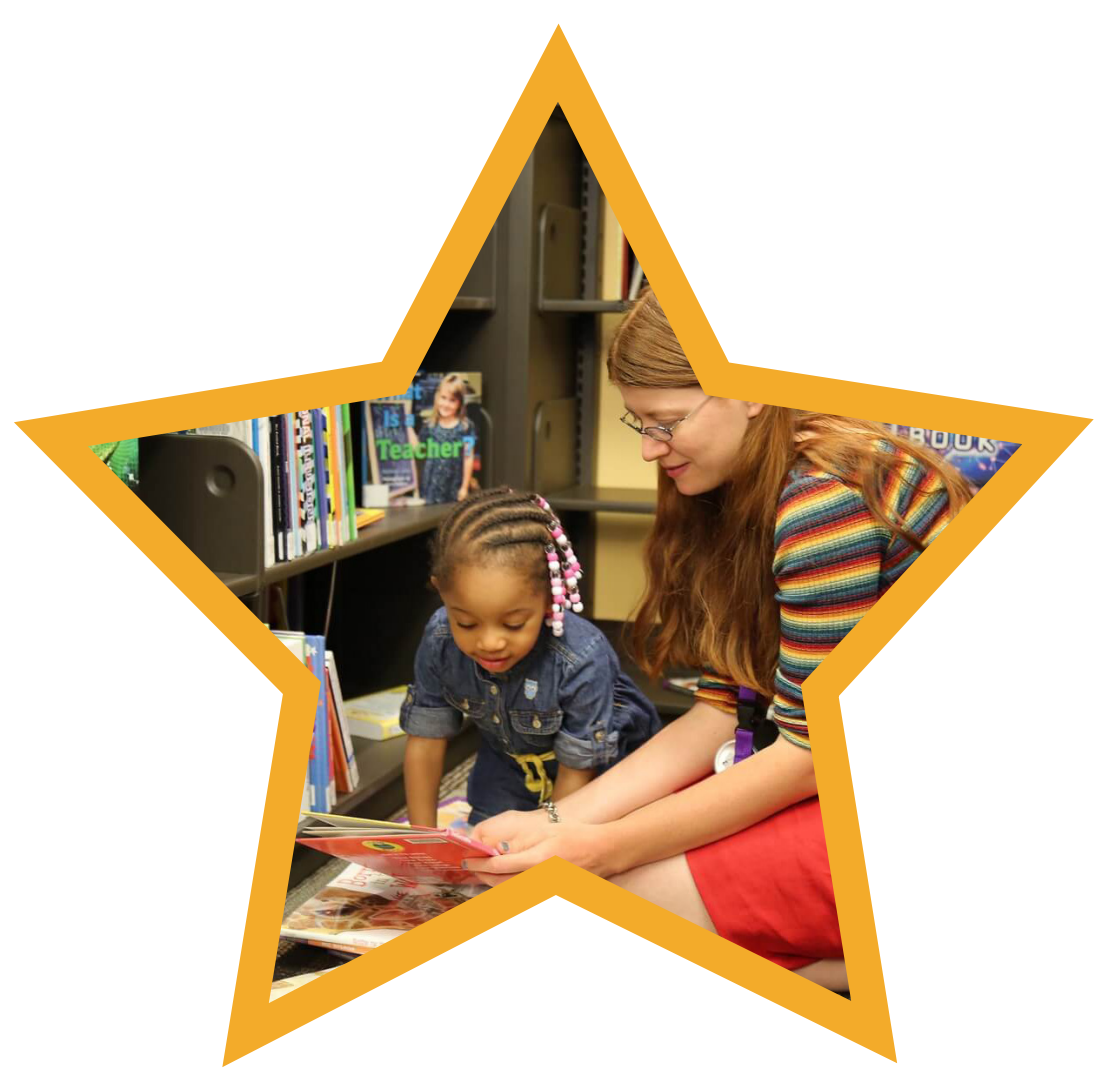
Visiting the library