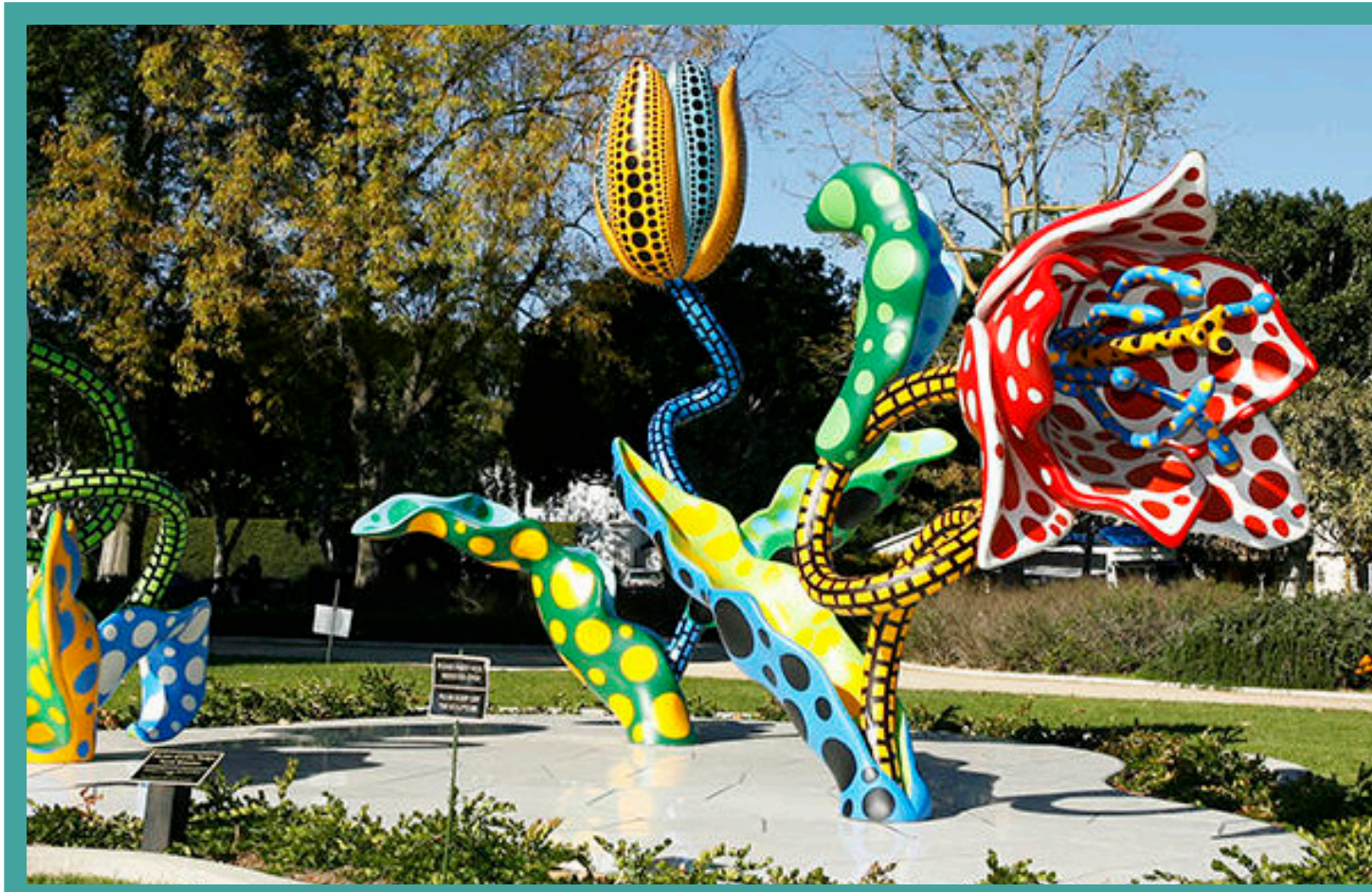
Art / Sculpture